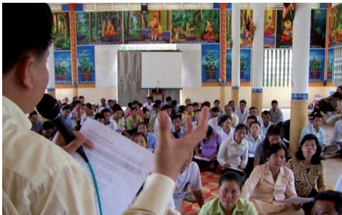
Awareness-raising about the right to health.

In order to effectively realise rights and shift power towards the rights-holders, accountability mechanisms such as participatory monitoring and reporting and complaint mechanisms are needed.