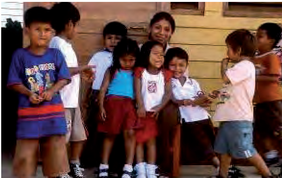
Teacher with pupils.

What locally adapted education systems had set in motion was fed in to the National Education Plan, developed under the auspices of the National Education Council and other educational institutions. Basic features of the National Education Plan included access to educational institutions without discrimination, their availability and the design of educational content of high quality that takes account of gender and inter-cultural issues.