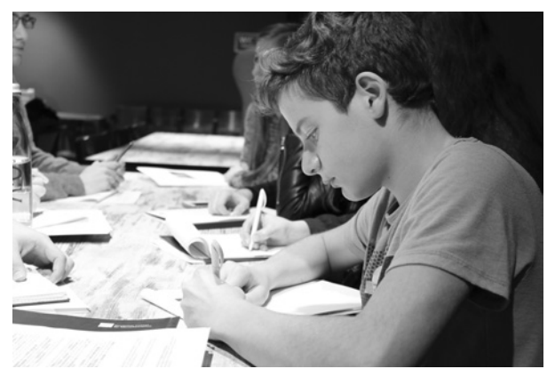
Snapshot of the participation group taken during the second workshop, November 2015 I \circledcirc DIMR

All of the respondent participants believed that the youth consultation had contributed to strengthening their knowledge base and skills. The youth consultation created a space for them to learn, have new experiences and develop their own ideas. However, some participants would have preferred to be involved in the preliminary planning and to have had the opportunity to take on more organisational and moderation activities during the workshops.