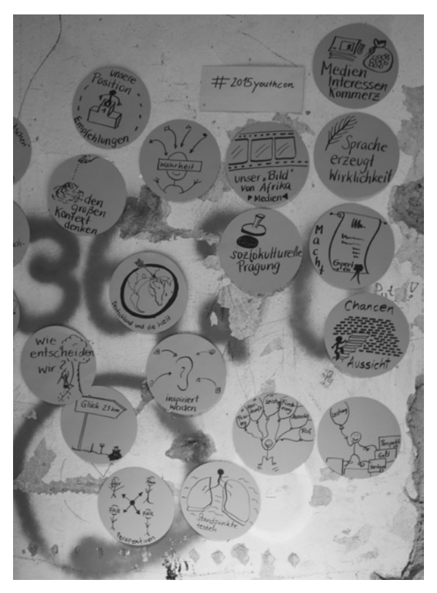
Documentation of outcomes from the diversity training at the first workshop, October 2015.

young people discussed human rights activism in different historical epochs and regions<sup>20</sup> and, as part of the cultural programme, went on tour of Berlin on the trail of German colonial history.