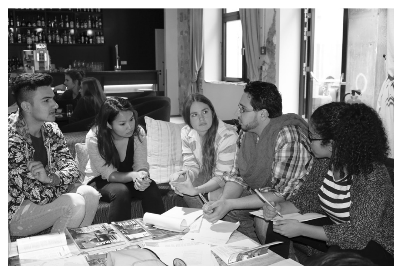
Group work during the first workshop, October 2015 I \ensuremath{\text{\texttt{GDIMR}}}

In the evaluation conducted in March 2016, some young people questioned whether the Institute's