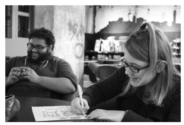
Young people use cartoons to visually represent the content of discussions at the second workshop, November 2015

identified as priorities, such as economy and climate change, could not be dealt with in detail.