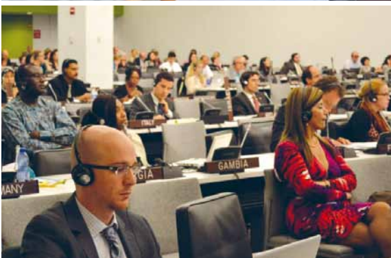
Meeting of the UN Open-ended Working Group on Ageing in New York in 2012.