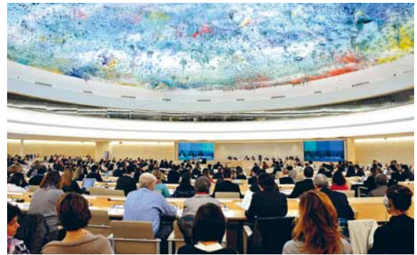
Session of the Human Rights Council in Geneva to review the human rights situation in Germany.

Another problem area is investigations into allegations of police brutality. The German government rejected the recommendation that it set up independent bodies to handle complaints of police brutality. Since 2009 other UN bodies, the Institute and civil society organisations have pointed out that there is a need for action in this domain. Only a small number of complaints result in an investigation, and even fewer cases ever lead to a conviction. You cannot just dismiss that by saying that most of the accusations were false. The reasons are far more complex: for example because of a misunderstood esprit de corps , police officers hardly ever testify against their colleagues. Moreover, it is often the case that the accused officer cannot be identified. Here, mandatory identification of the kind recently introduced in some German states would help.