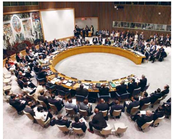
The UN Security Council deliberates on the humanitarian situation in Syria, August 2012.

Closer cooperation is important because the two organs often work largely independently of each other on the same country. The Human Rights Council frequently sends experts to a country with which the Security Council is also concerned. How can the information gathered by them be communicated more quickly and more systematically to the Security Council? Such cooperation could help the Security Council to take faster action in cases of severe human rights