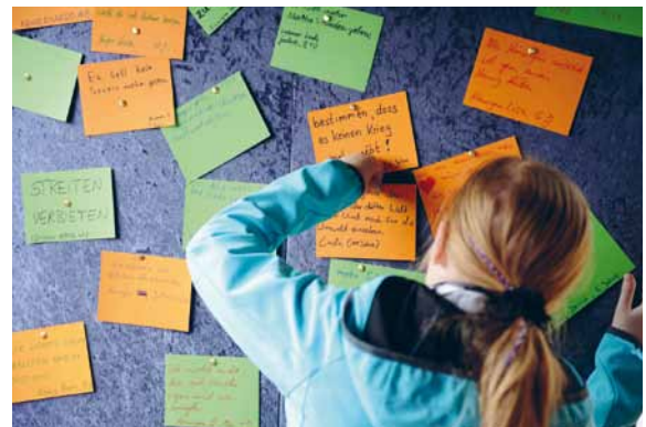
Strengthening children's rights and co-determination. Girls on International Children's Day in Cologne.

There are still many deficits in the implementation of children's rights. Putting 16 and 17-year-olds into custody pending deportation is just one example of many. A comprehensive and systematic revision of the compatibility of German law with the CRC is therefore urgently needed. The United Nations Committee on the Rights of the Child has recommended the establishment of an independent body for monitoring the Convention's imple-